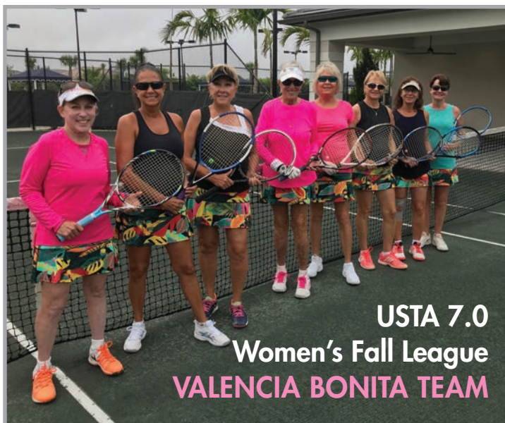
USTA 7.0 Women's Fall League VALENCIA BONITA TEAM

BOCCE: We have started league play for the Fall, but if you are interested in league play for the winter please e-mail us. Open play on Sunday and Wednesday evenings.