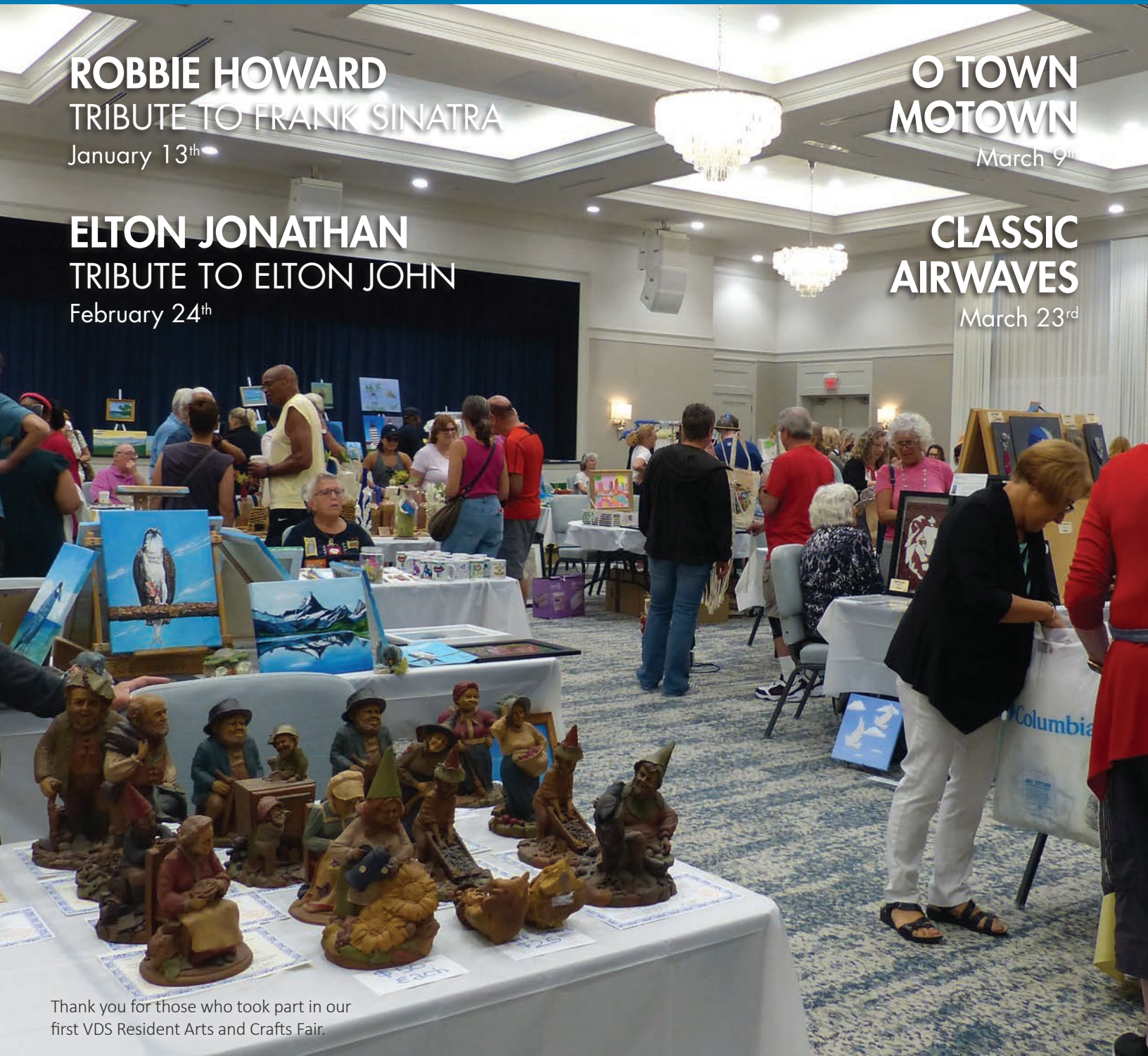
Thank you for those who took part in our first VDS Resident Arts and Crafts Fair.